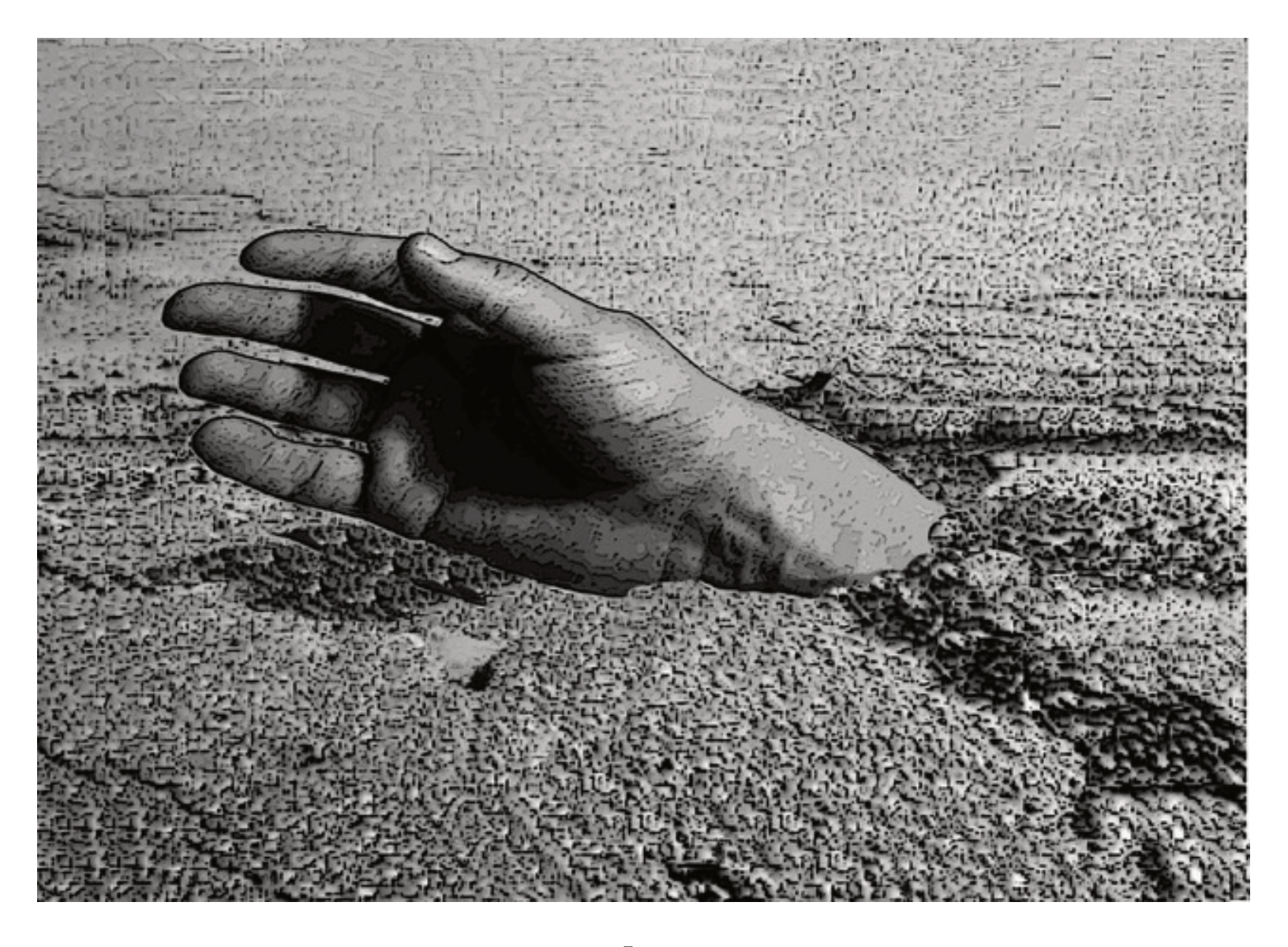
Street Hand by Tim Hildebrandt