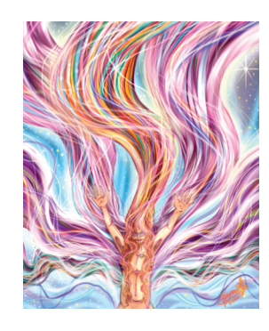
The Trans Magic Within Me