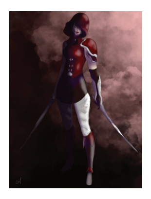
Red Ridinghood: Assassin